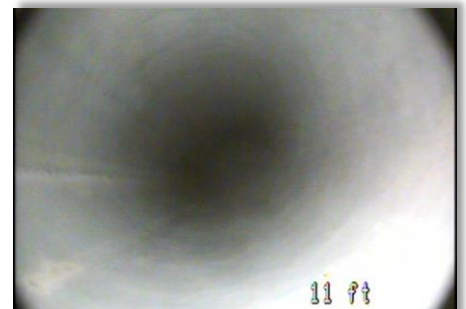
After pipe was lined

We are pleased to announce another successful project and proudly add