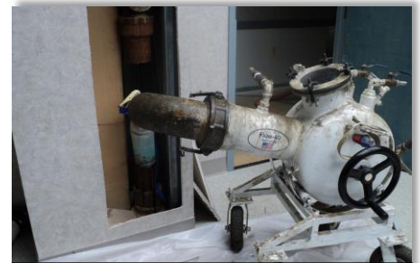
Flow-Liner® being installed

“Your product saved us from costly excavation under the main building slab...we highly recommend your pipe liner and consider it a valuable option. We will look to you in the future should we face similar circumstances.”