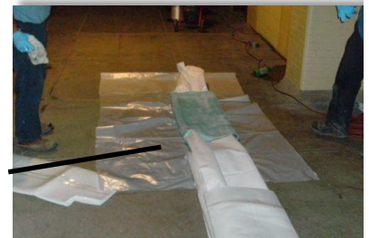
Pipe liner being prepared

The Pipe was repaired without demolition or excavation. The Federal Court House Building and the busy street intersection were untouched. The GSA Supervisory Architect had the following remark in his thank you letter: “The liner is working and your responsiveness over the Thanksgiving holiday has been highly appreciated. We can’t believe what a great job you guys did on short notice.”