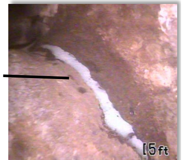
Cracked portion of pipe sealed by the sectional CIPP liner

We are pleased to announce another successful project and proudly add