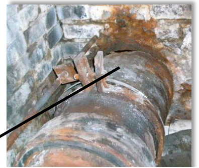
Cracked and deteriorated pipe exiting through wall