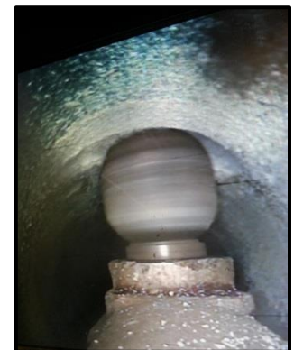
Reinstating tap with robotic cutting system

We are pleased to announce another successful project and proudly add