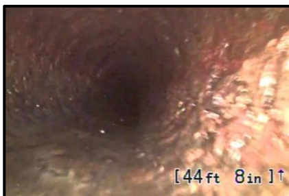
Cast Iron before cleaning