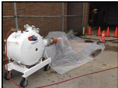
Flow-Liner® Equipment Set-up

"The pipe lining crew was very professional and courteous. They did a great job for us and in a timely manner. The pipe lining saved us from having to dig up and replace the piping, which would have been very costly and inconvenient. We highly recommend your product and consider it a viable option compared to pipe replacement."