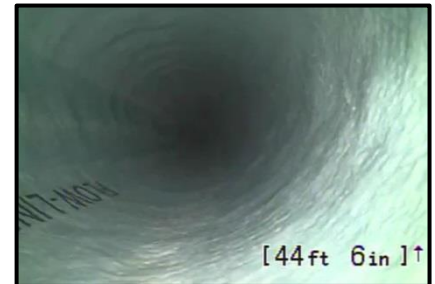
Cast Iron after Flow-Liner® installation