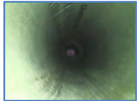
After Flow-Liner® was Installed

The Flow-Liner® Installer successfully lined the steel pipe. The Facility Engineer made the following remark; “The lining process was very cost effective in that it eliminated the need to replace the line and without breaking up the tank’s floor.”