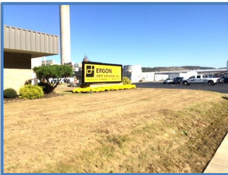
ERGON- West Virginia, Inc.

Ergon, Inc., is a privately held company and operates under six primary business segments: Refining & Marketing, Asphalt & Emulsions, Transportation & Terminaling, Oil & Gas, Real Estate, and Corporate & Other.